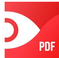
PDF Expert- Editor & Reader

Free to Download Offers In-App Purchases iPhone, iPad, & Android