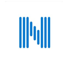
NaturalReader- Text To Speech

Free to Download, Offers In-App Purchases iPhone, iPad, Android, & Web Application