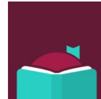
Libby, by OverDrive

Free to Download iPhone, iPad, & Android