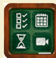
First Then Visual Schedule HD

For more information about helpful apps, visit BridgingApps.org , a program of Easter